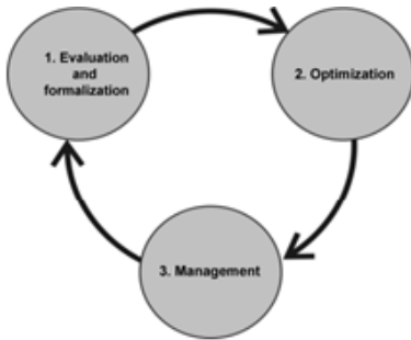
Fig. 2. Structure of the risk assessment process of the project and identification of measures to respond to it

3. Risk assessment and response to them. This process consists of three components, and is characterized as an on-going cyclical process (Fig. 2).